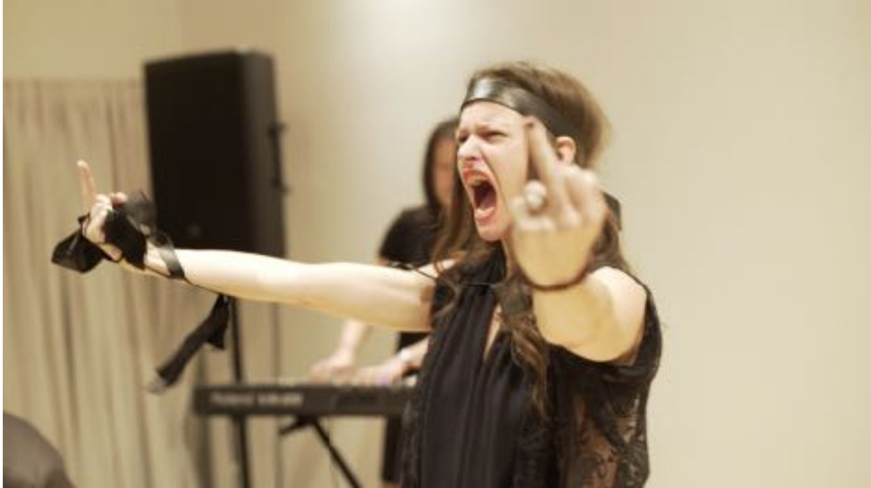
CEMETERY , performed live at the New Museum (2017)