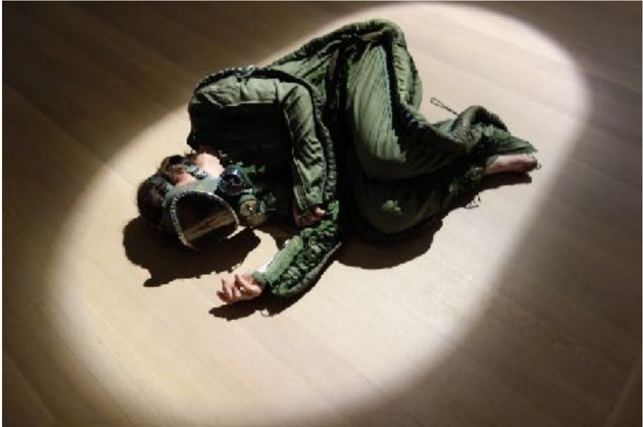
WARFARE , photograph series, The Retrospective of an Extroverted Recluse show (2016)