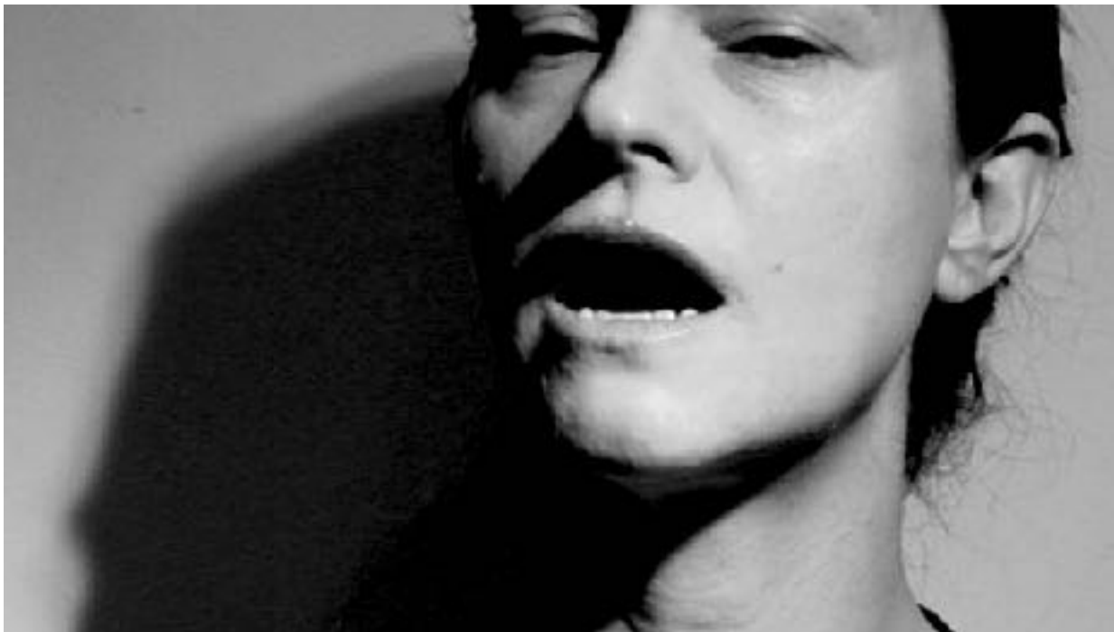
UNKNOWN , short film, New Museum (2017)